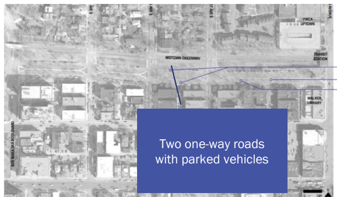
THE MALL - EXISTING CONDITIONS